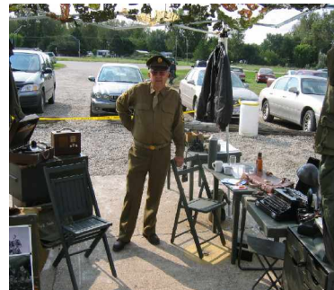
Part of the Aviation